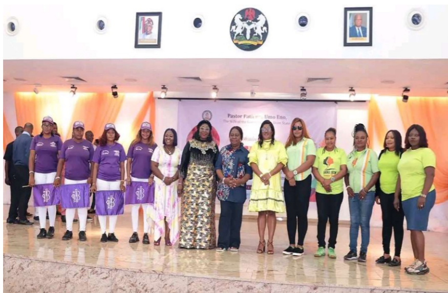
Akwa Ibom Youths marking 2023 World Youth Skills Day with Her Excellency flanked by the State Deputy Governor.