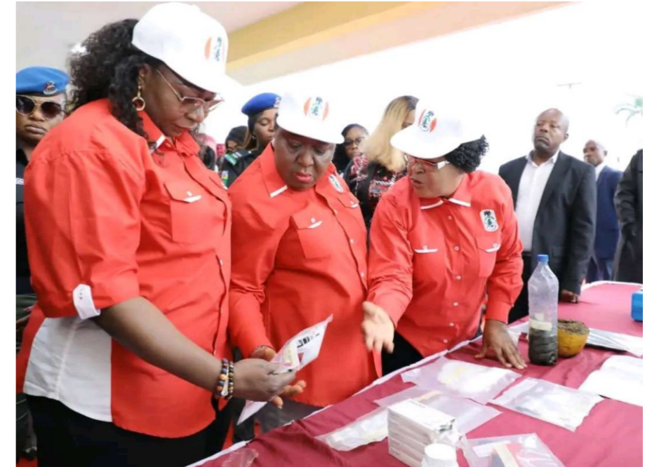
Inspection of illicit substances and drugs on display at the International Day of Drug Abuse