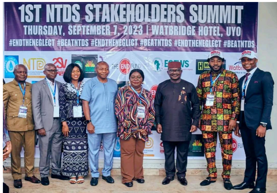
At First Natural Tropical Diseases (NTDs) Summit in Akwa Ibom State.