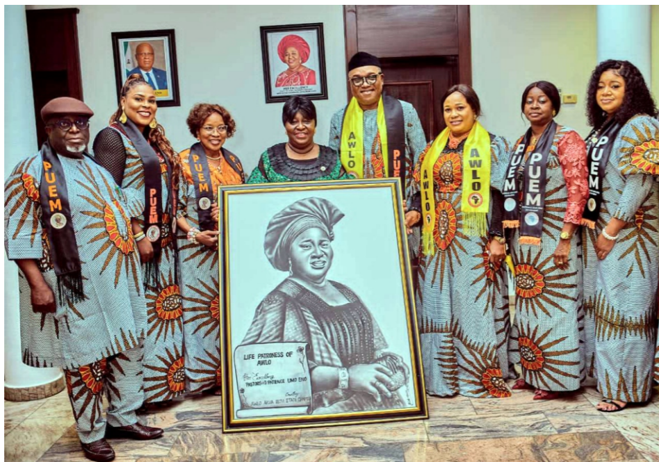
Courtesy visit by AWLO and PUEM