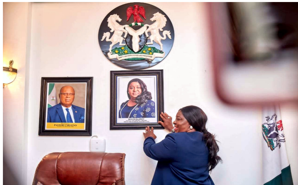
First Day in office