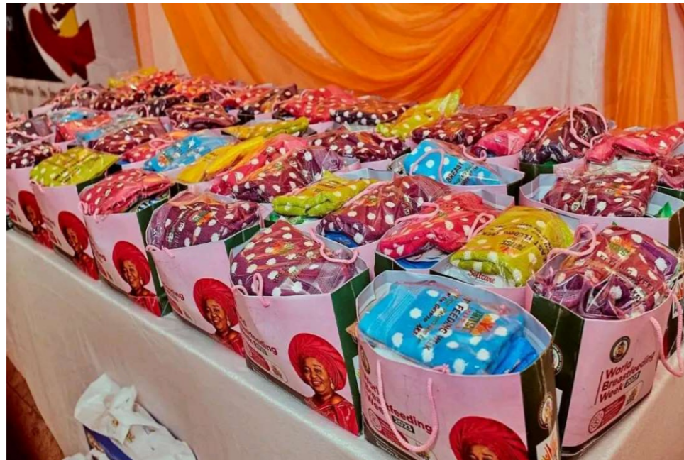
Gift packs for nursing mothers to mark the 2023 breastfeeding week