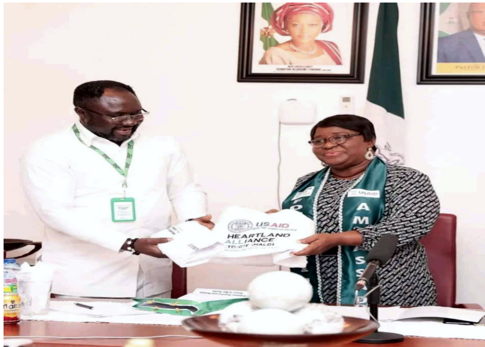
Courtesy visit by Heartland Alliance