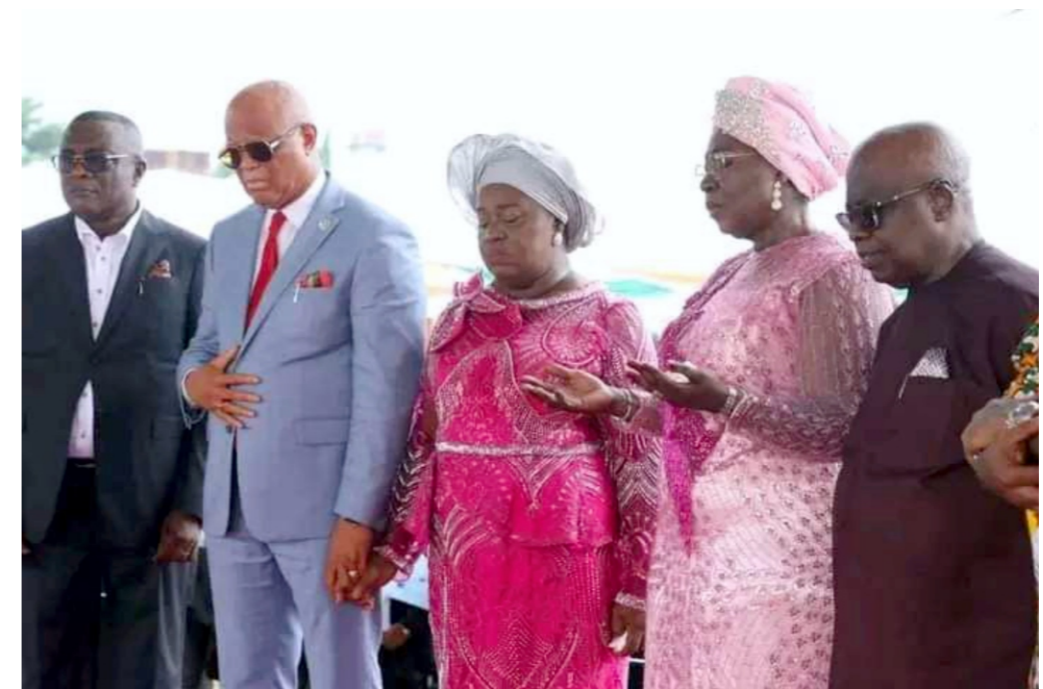
Thanksgiving service at Ibom Hall Grounds