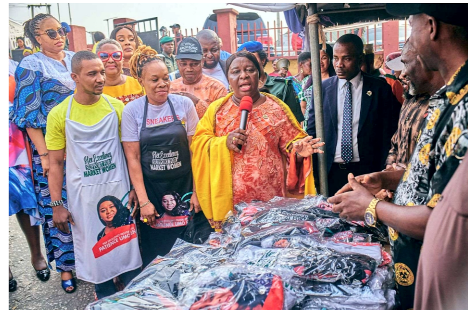
At the unveiling and presentation of aprons to market women in Uyo, by Prince Archibong Life Foundation