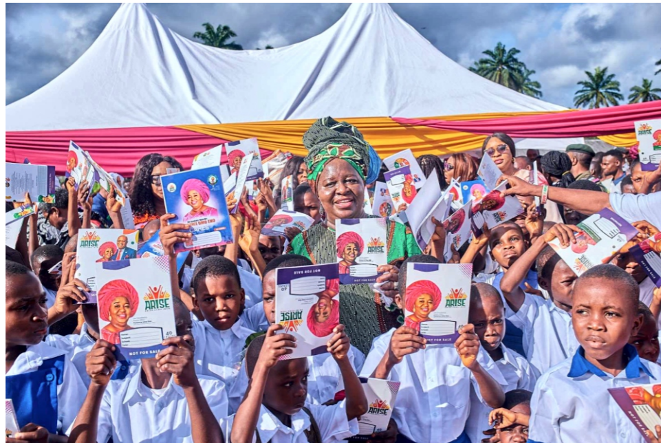
At the School Outreach programme in Ikot Ekpene Udo, Nsit Ubuim LGA