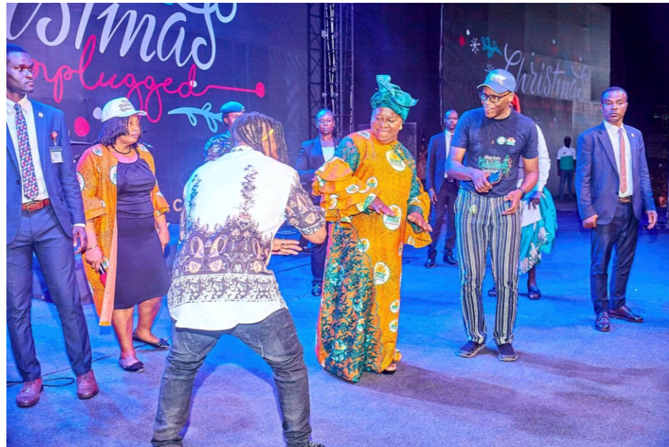
At the Official opening of Christmas Unplugged