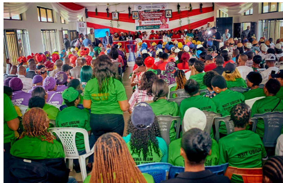
AKSDCC Townhall Meeting at Nsit Ubium LGA