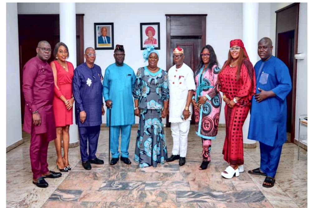
Courtesy visit by Demakers Business Roundtable