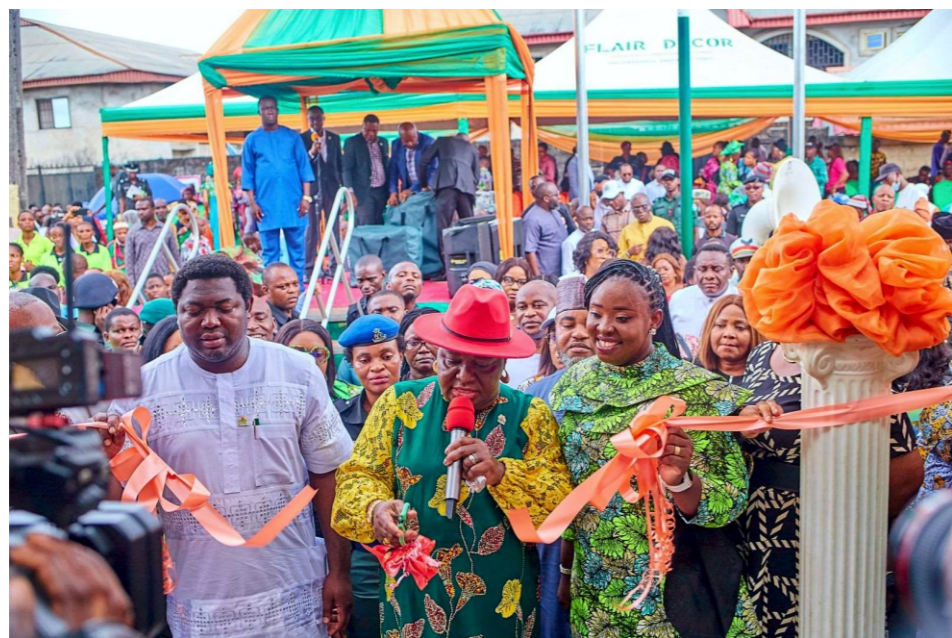
Her Excellency inaugurating a Primary Health Care Centre in Ikot Ebido Oku, built by the Chairman, Uyo Local Government Council