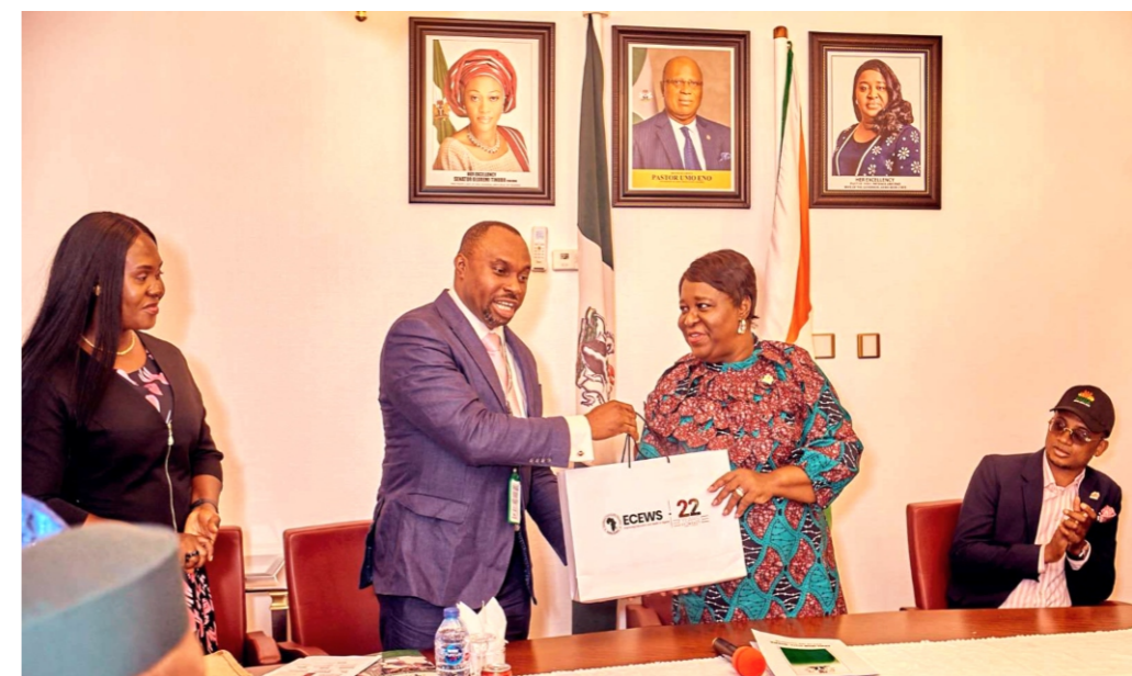
Presentation of gift by ECEWS