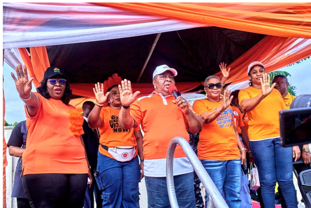
Flag-off campaign of 16 Days of Activism Against Gender Based Violence