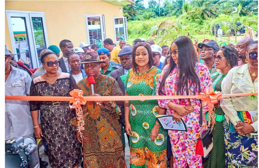
Inauguration of YAK EMEM ABA Administrative Office Complex in Nsit Atai Local Government Council built by the Chairman.