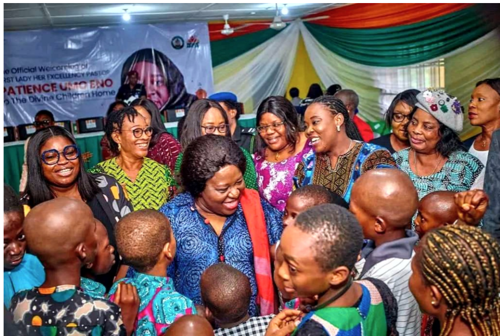
Visit to the Divine Children's Home, Atan Offot, Uyo.