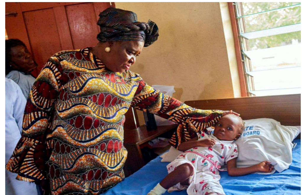
At Pope John Paul II, family life Centre/VVF Hospital, Mbiribit Itam, Akwa Ibom State