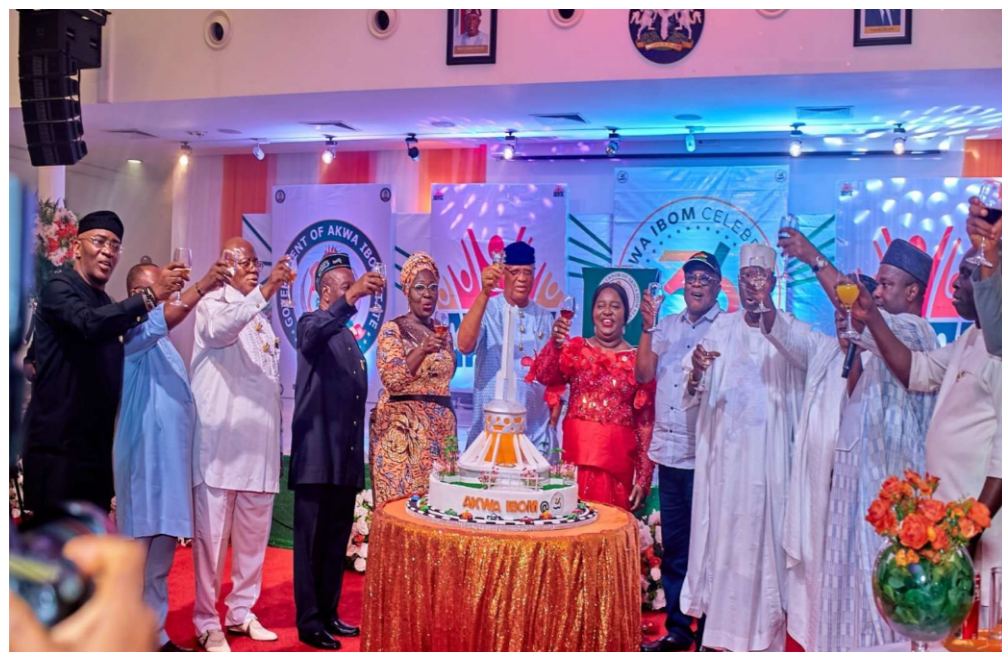
Celebrating Akwa Ibom State @ 36