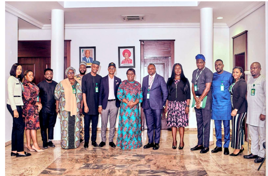
Courtesy visit by ECEWS