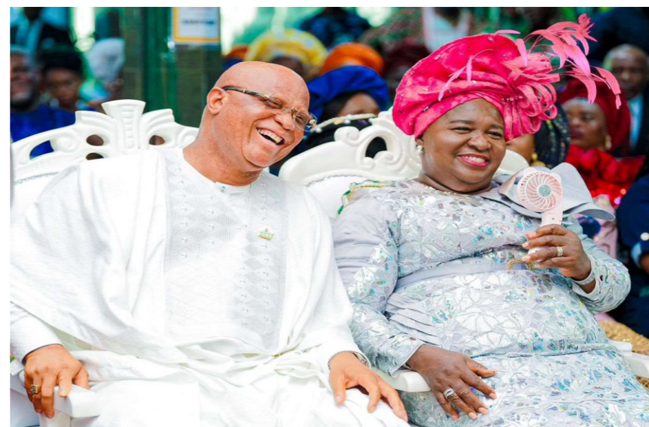
At the Supreme Court Victory Thanksgiving Service at All Nations Christian Ministry International in Eket