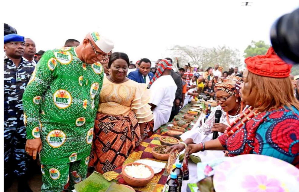
Nsit Ubium Delicacies on display at Christmas Unplugged