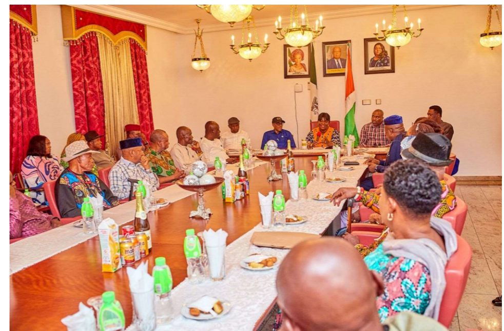
Meeting with Mkpato Enin Stakeholders