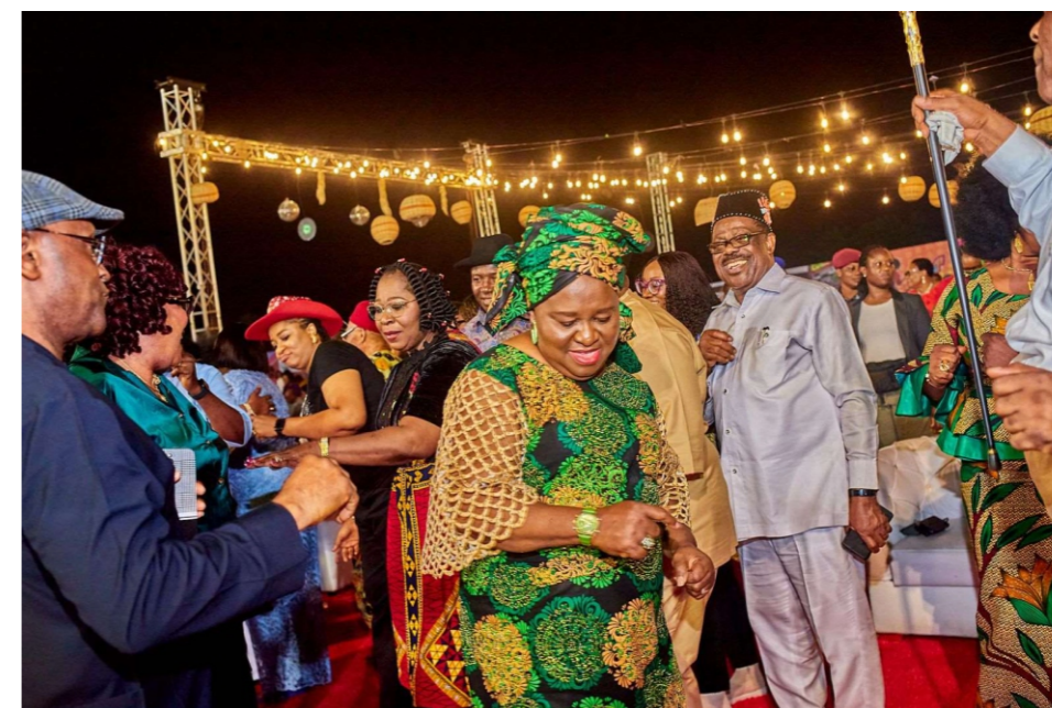
Old School Party at Christmas Unplugged