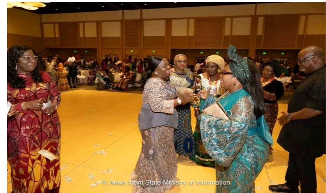
At the AKISAN National Convention, San Diego, USA.