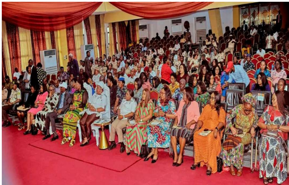
At 60 th Anniversary Celebration of the Nigerian Immigration Service event