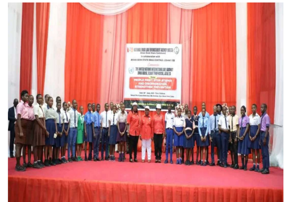
The Governor's wife, Pastor Patience Umo Eno posing with a cross section of students at the International Day of Drug Abuse held in Uyo.