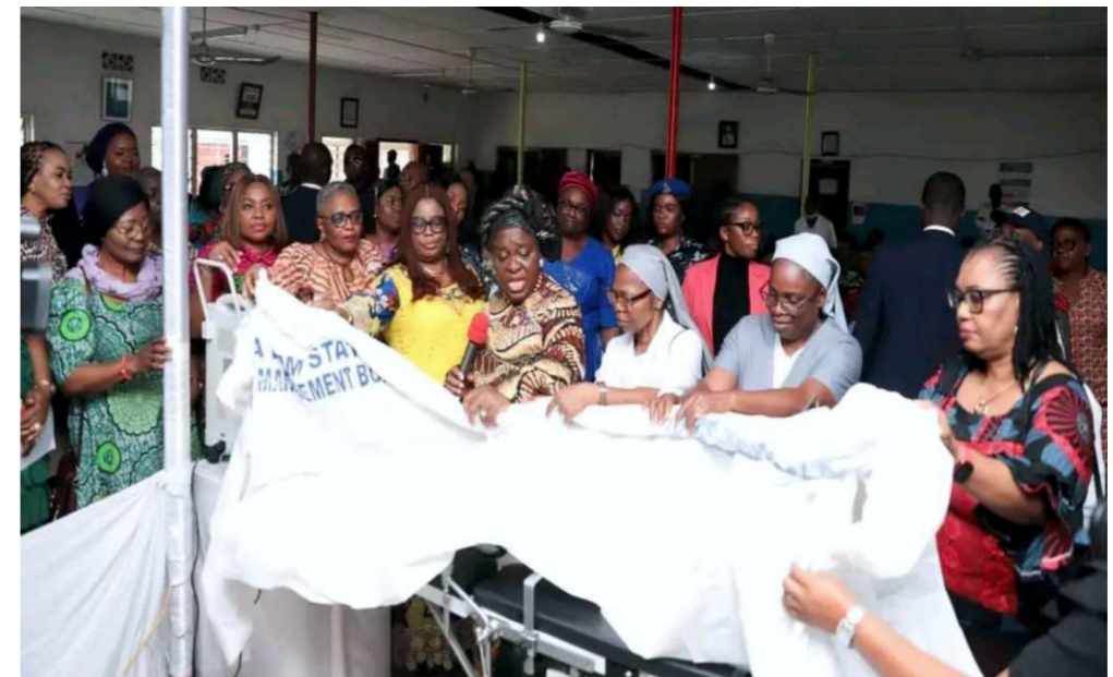
Unveiling of medical equipment to Pope John Paul II, family life Centre/VVF Hospital, Mbiribit Itam, donated by the Esop Mbong Ibaan Akwa Ibom State, Dallas, USA.