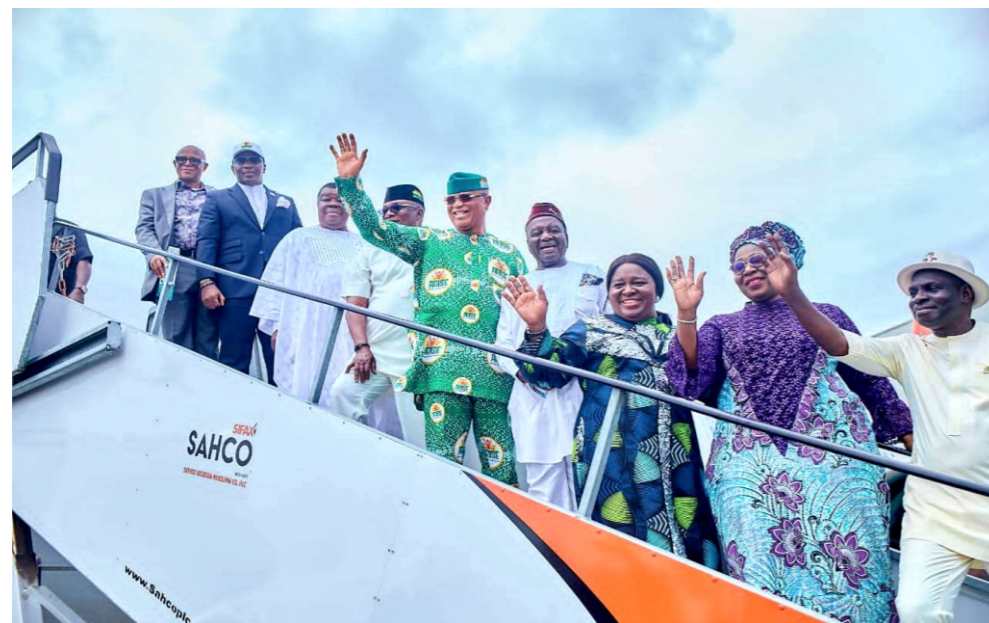
On Airbus A220, the latest addition to Ibom Air fleet.