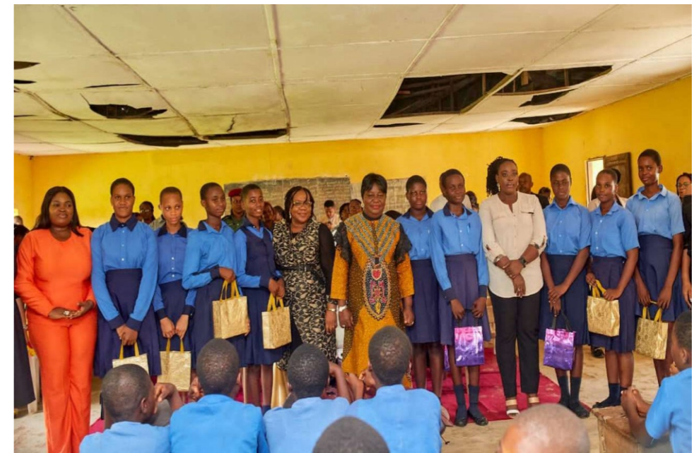
International Day of the Girl Child at Community Secondary Commercial School, Ikot Oku Ikono, Uyo