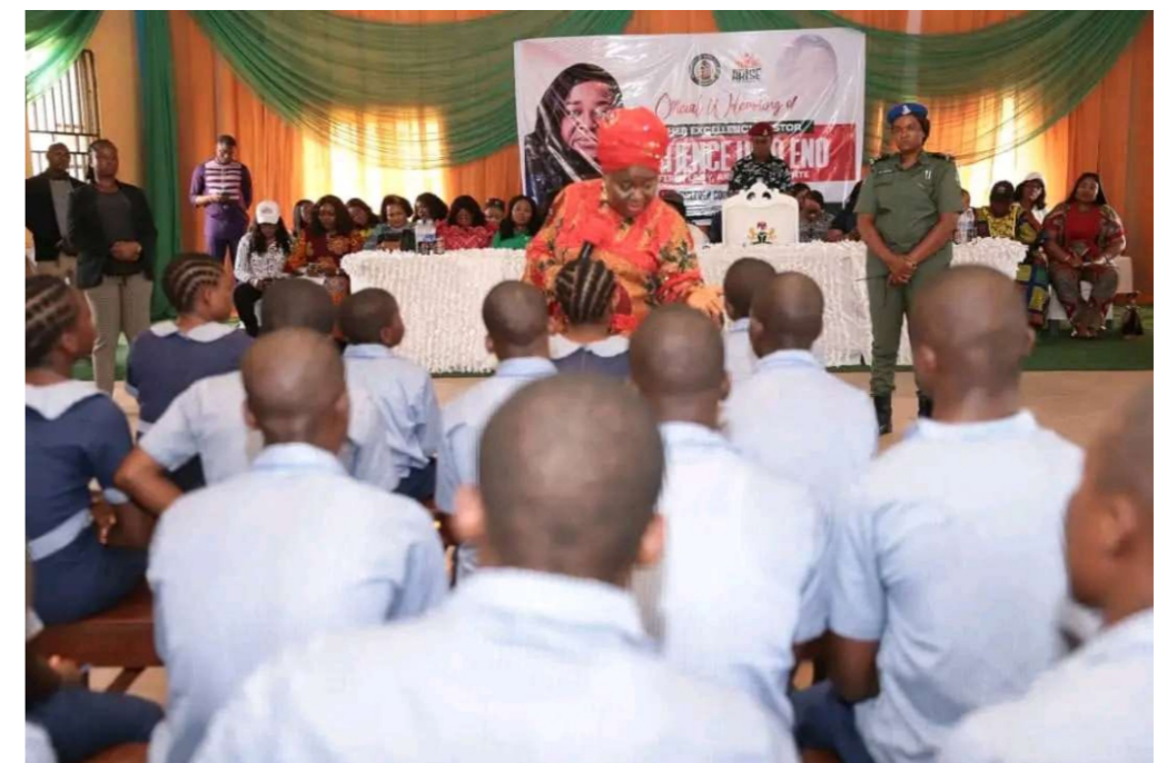
Visit to Juvenile offenders at the Children Correctional Centre in Uyo.