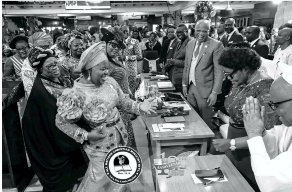
At the 19 th Anniversary of All Nations Christian Ministry International