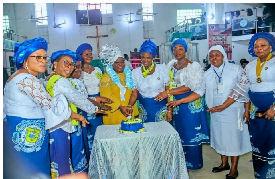
45th Biennial Conference of the National women's Fellowship of Methodist Church, Ikot Ekpene LG.