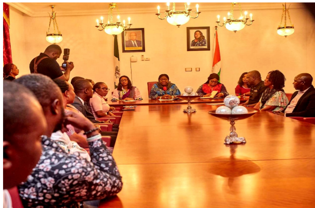
Maiden Meeting with staff