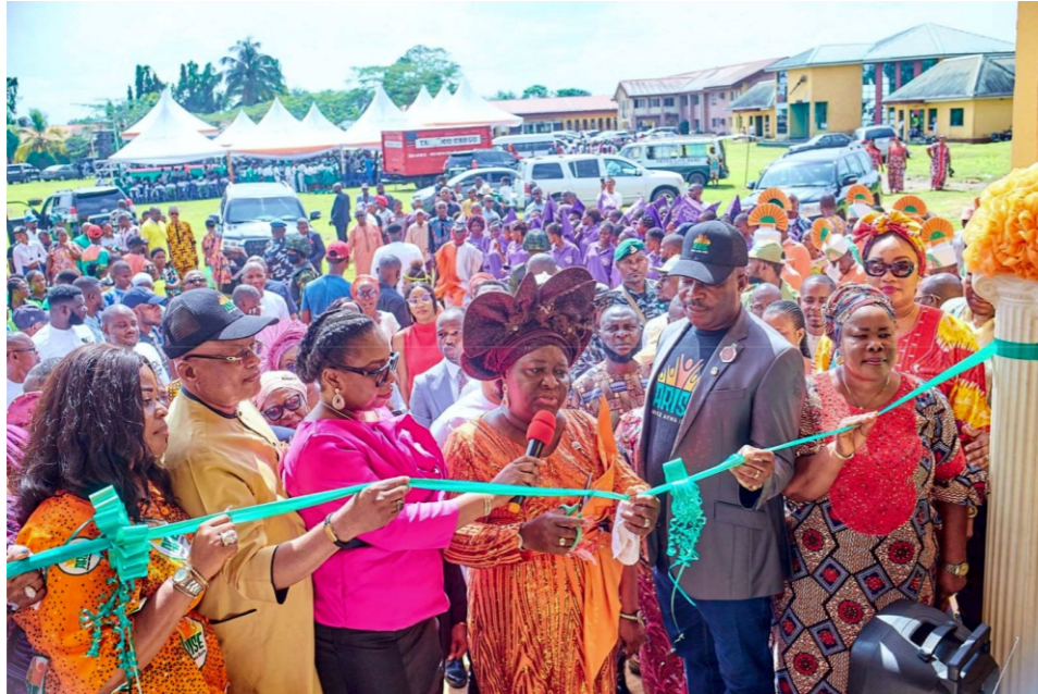
Her Excellency inaugurating ICT Center, Etinan built by the Chairman of Etinan Local Government Council