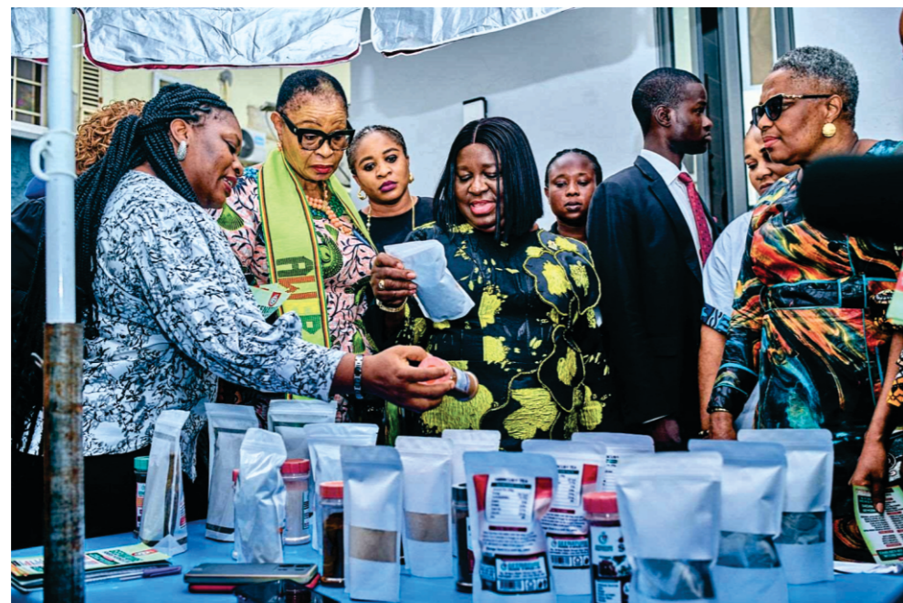
Her Excellency inspecting products exhibited by AWEF, AKS