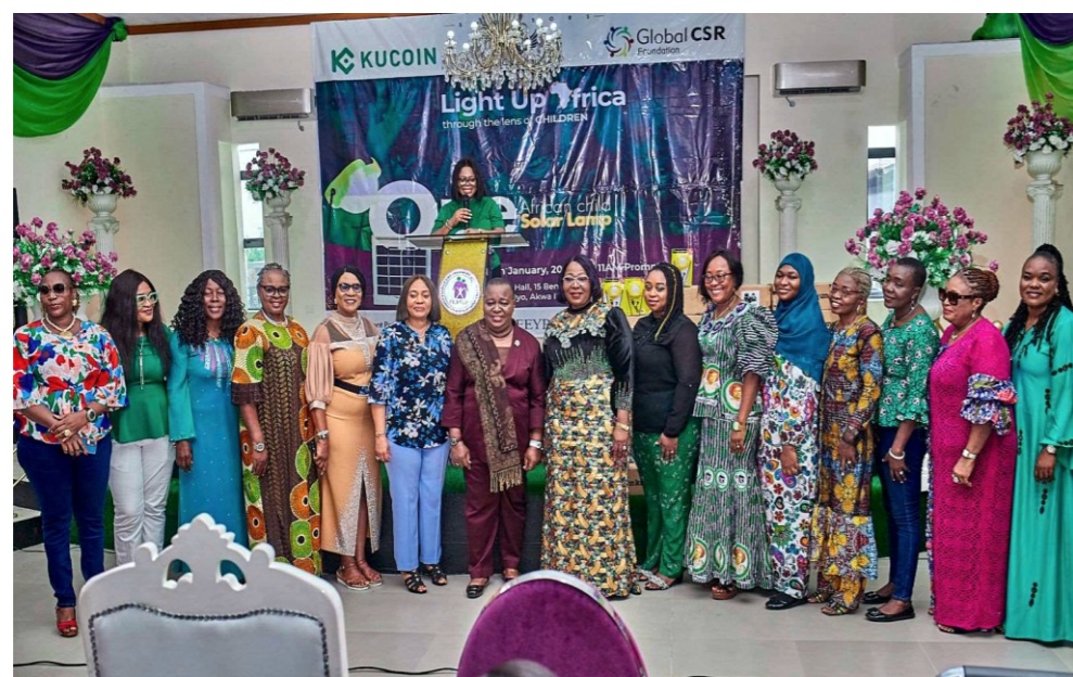
At FEYReP's Light Up Africa Project