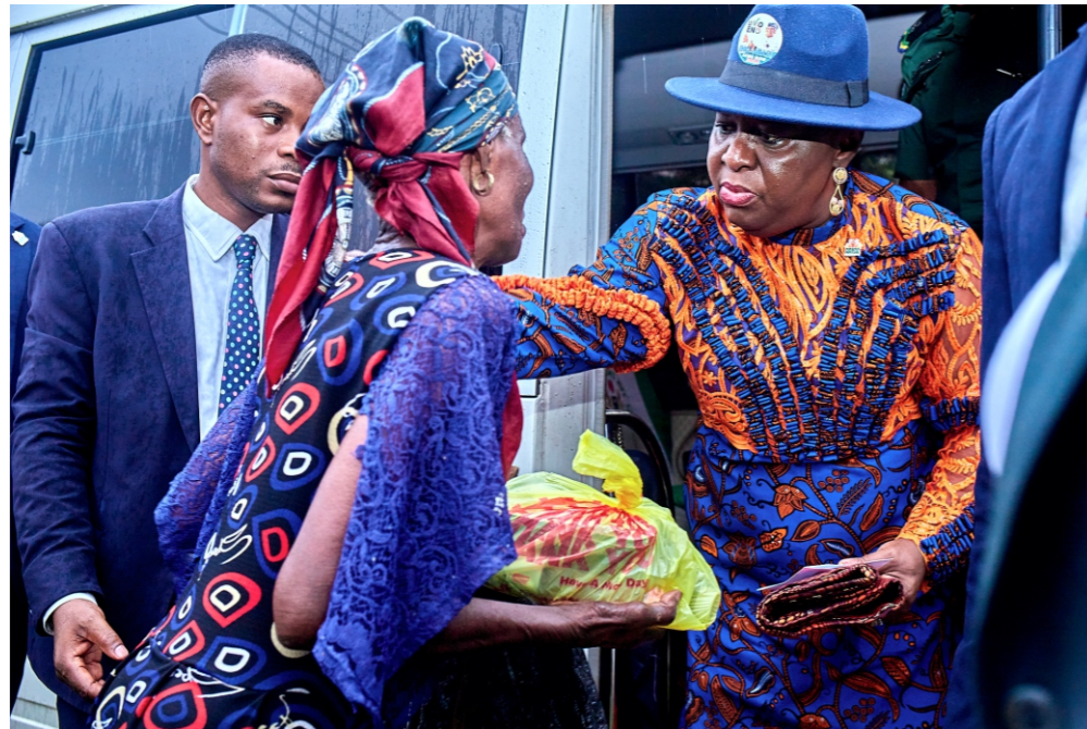
Giving succour to an elderly woman