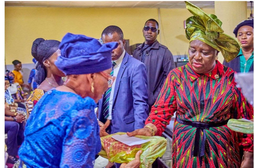
Her Excellency giving financial support/gifts to women at Mkpai Enin