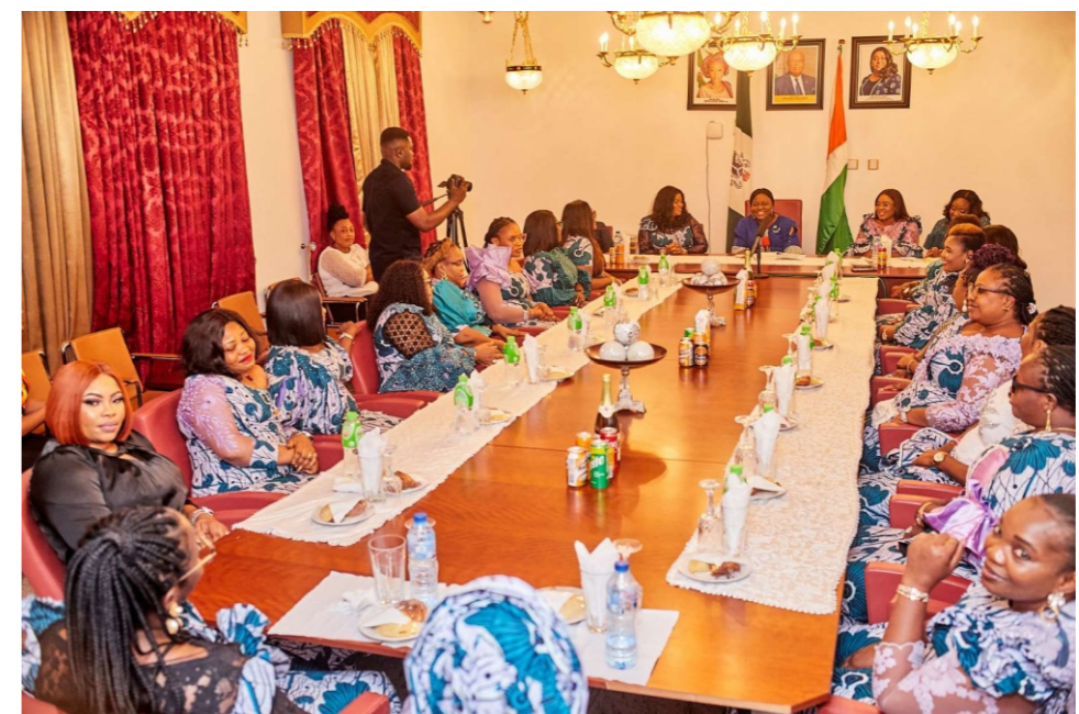
Courtesy Visit to Her Excellency by WALGON