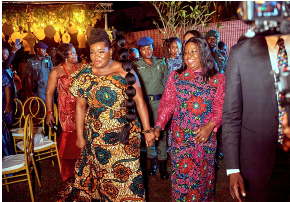
At Seventh Anniversary of "Blue Print of How" in Uyo