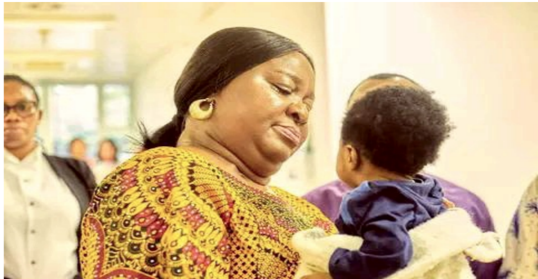
Our compassionate mother visits children in the hospital and pays their bills.