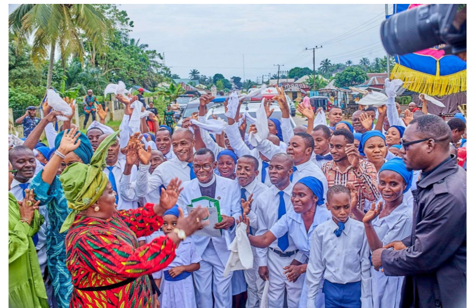
Unscheduled stop over to join the witness movement of the Apostolic Church, Nigeria, Afaha Nsit District