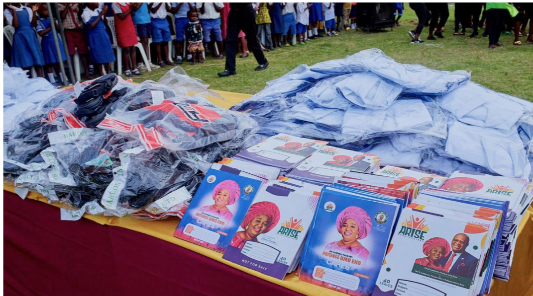
School uniforms and books set for distribution to Public Primary School pupils by her Excellency