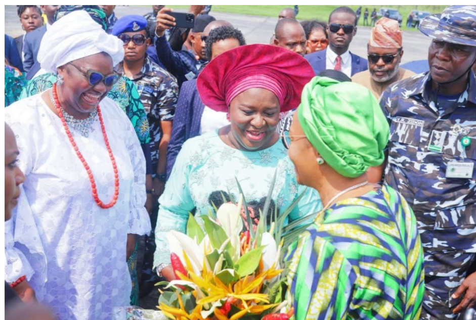
Nigeria's First Lady, Senator Oluremi Tinubu on arrival at the Victor Attah International Airport, Uyo.