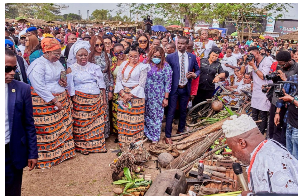
At Mkpat Enin Day during Christmas Unplugged event