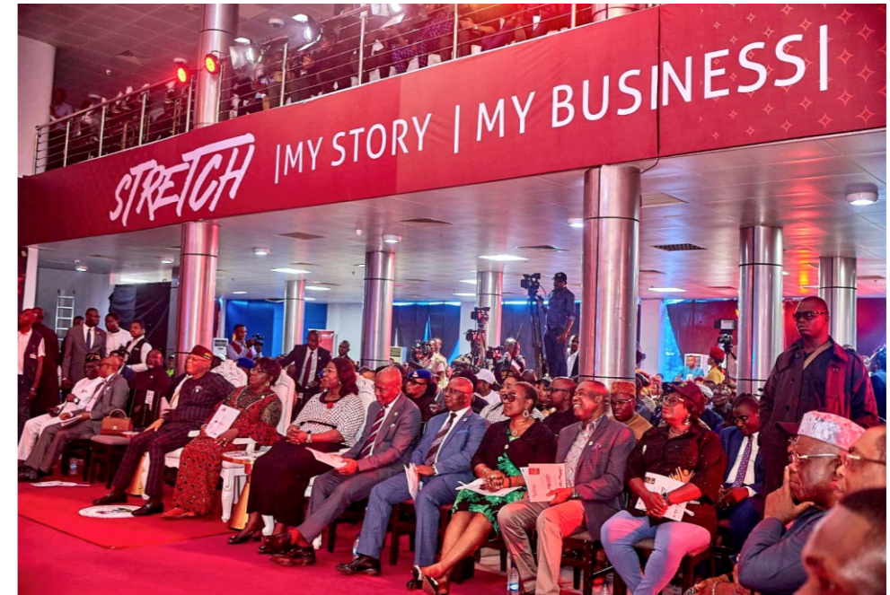
At Ibom Ignite Entrepreneurial Summit in Uyo