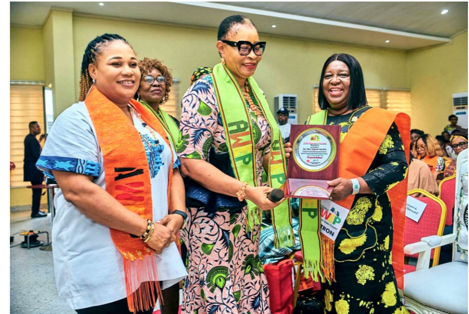
AWEP honours Her Excellency with Humanitarian Award during 2024 leadership Recollection Retreat in Uyo