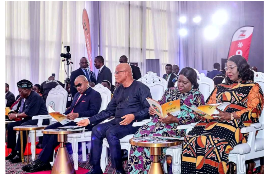
Ibom Dialogue event