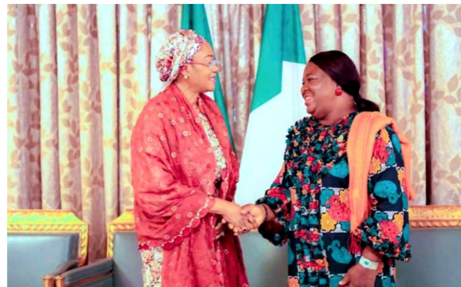
Meeting with Senator Oluremi Tinubu at Aso Rock, Abuja.