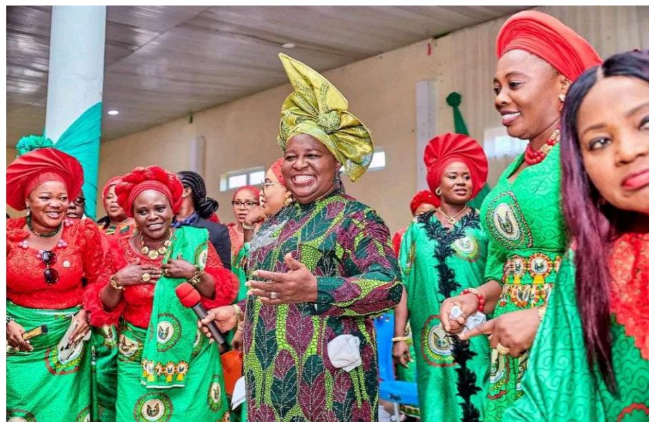
At Ikot Ekpene Senatorial District Women Forum End-of-the year programme.