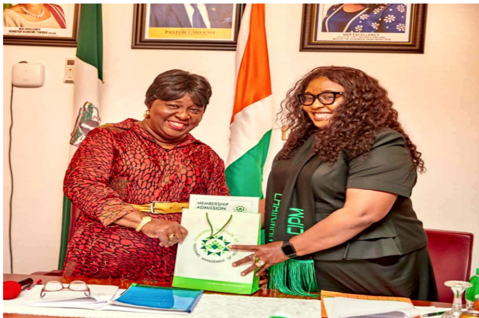
Courtesy Visit by Chartered Institute of Personnel Management, Akwa Ibom State Chapter