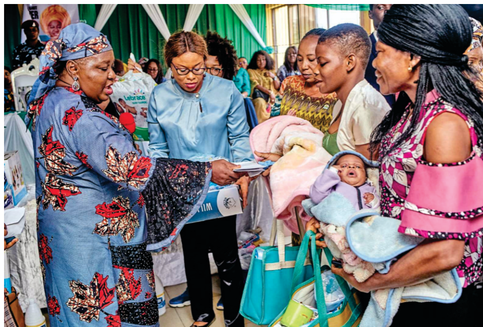
Her Excellency presenting gifts to nursing mothers at the Multiple Birth Empowerment Programme in Eket Senatorial District