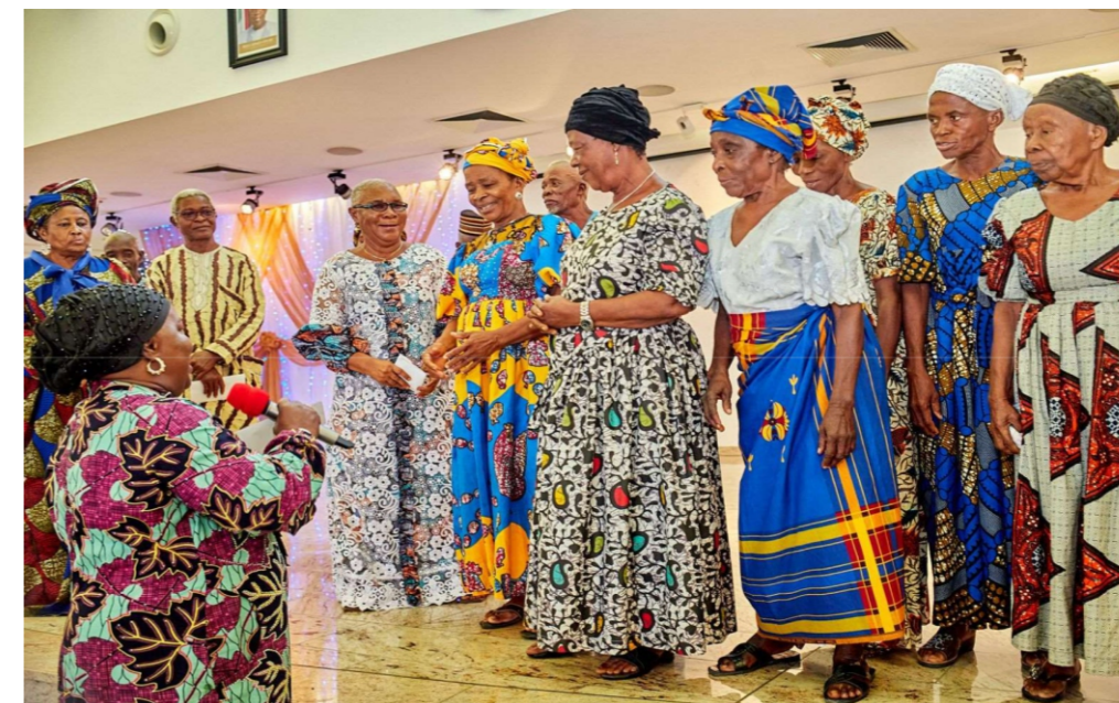
Financial support to the elderly