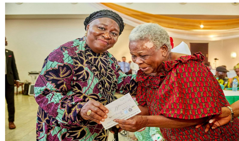
Financial support to the elderly powered by Senator Oluremi Tinubu's Renewed Hope Initiative Elderly Support Scheme